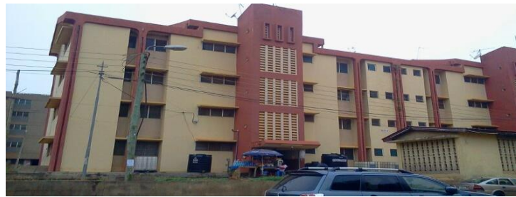
Plate 1: A view of one of the new blocks (Field Survey, 2014).

The Asuyeboah SSNIT Flats in Kumasi consist of three storey and four storey structures which are rectangular in form. These individual structures are referred to as blocks. These blocks are further divided into apartments on each floor. In all, there are 554 flats in 23 blocks. Blocks 1-3, 8, 10 and 11 have 28 flats each. Blocks 14 - 23 have 16 flats each, whilst blocks 4-6, 9, 12 and 13 have a combination of 3 bedrooms, two bedrooms and bedsitters. The blocks which were built earlier have courtyards whereas those that were built later do not have the courtyard system. In the old blocks, there is also one balcony for each unit. The roof is made of corrugated aluminium sheets. The blocks also have parking spaces available which are more than adequate in size for the current population of the people in the flats with cars.