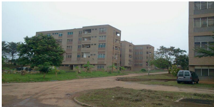
Plate 2: A view of some of the old blocks (Field Survey, 2014).