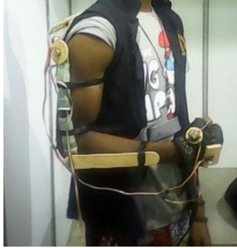
Figure 4: Wearable Robot Arm