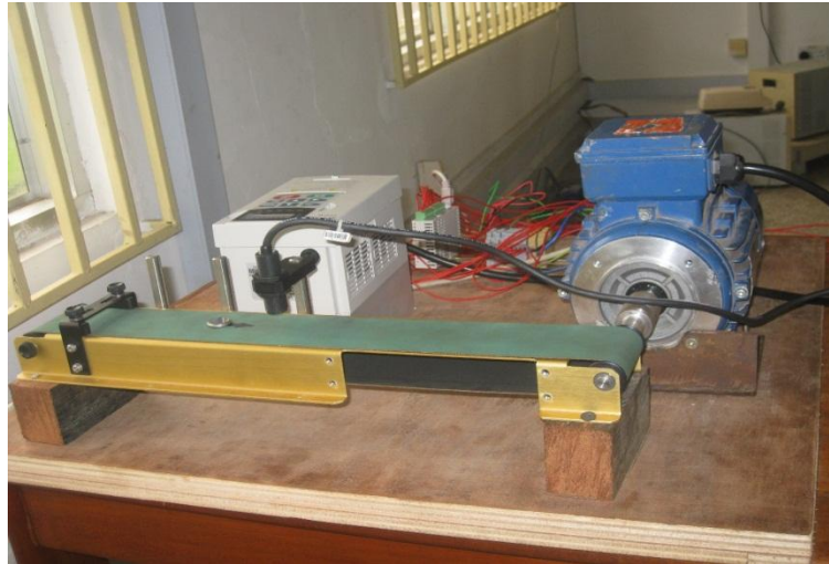
Figure 5a: PLC Conveyor Speed Control and Part Counting System – Actual System

Sackey, S. M 1 ., and Adam, F. W 2 . (2015) Mechatronics Curriculum development in an Emerging Economy – The Case of The Knust, Ghana. In: Mojekwu, J.N., Ogunsumi, L.O., Ojigi, L.M. Atepor, L., Thwala, D.W., Sackey, S. Awere E., and Bamfo-Agyei, E. (Eds) African Journal of Applied Research .(AJAR) Journal, Vol.1, No.1 ISSN 2408-7920 January 2015, Cape Coast, Ghana. 144-158