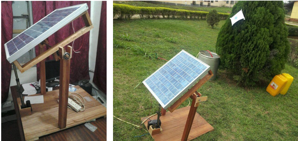
Figure 1. Solar tracker